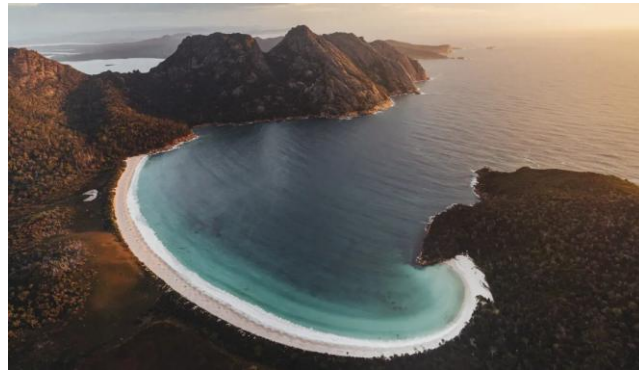
Freycinet National Park

^Mid-Size Car model example: Kia Sportage, Toyota Corolla Hatch, Toyota C-HR, Toyota Corolla Sedan