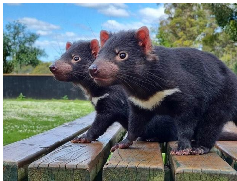
Trowunna Wildlife Sanctuary